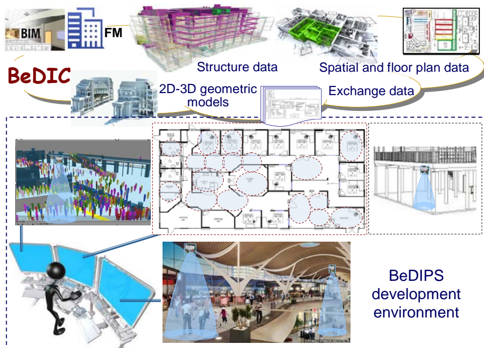
Figure 1 BeDIC in BeDIPS development environment

be built as extensions of 2D and 3D graphical facility management tools. The design and implementation of these tools are outside the scope of this report. They will be presented in a later report.